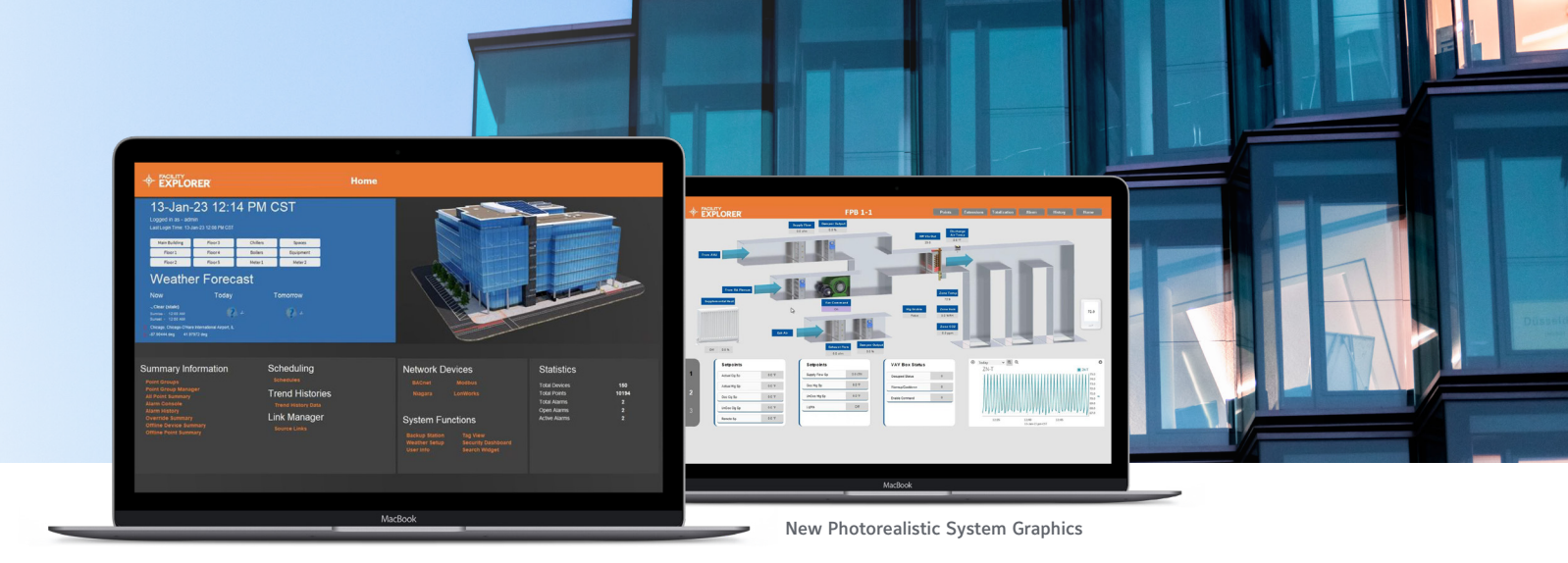
Facility Explorer Home Screen